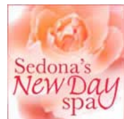
Sedona New Day Spa