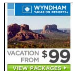
Wyndham Vacation Resorts