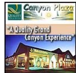
Canyon Plaza Inn and Suites